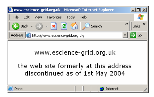
Figure 3: The first website returned by the Google^{TM} search for " e-science "

has vanished from the web. (At least those responsible for this site had the courtesy to say "goodbye" – many just stop supporting the site.)