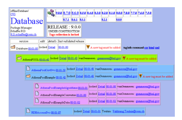
Figure 2 The details of the Database package.