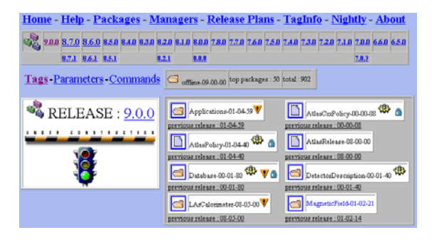
Figure 1 The top page for release 9.0.0, open for new user tags.

Figures 1 to 4 show some screen shots of the Tag Collector web interface.