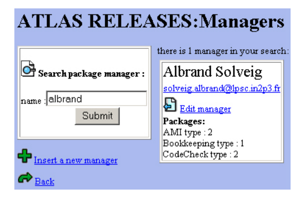
Figure 3 Searching for a package manager.