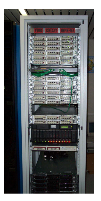
Figure 2: The Naples INFN GRID-IT farm

Using kickstart as the installation method and apt4rpm as the base package manager, this procedure can also be adapted to newer RedHat versions, and its derivatives like Scientific Linux [9], with little or no effort.