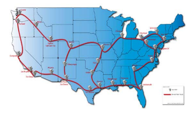
Figure 1 National Lambda Rail (NLR)

A prime example is "National Lambda Rail" [6] (Figure 1) covering much of the US, which is now coming into service with many 10 Gbps links, in time for the SC2004 NLR infrastructure, conference. The built to accommodate up to 40 10 Gbps wavelengths in the future, is carrying wavelengths for Internet2's next-generation Hybrid Optical and Packet Infrastructure (HOPI) project [7], and for Caltech on behalf of HENP. This is accompanied by initiatives in 18 states (notably Illinois, California, and Florida). ESNet also is planning to use NLR wavelengths as part of the implementation of its next generation network.