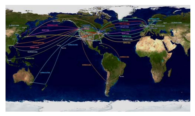
Figure 2 GLIF, the Global Lambda Integrated Facility

Scientists and advanced network providers around the world have joined together to form GLIF [20], "a world scale lambda-based lab for application and middleware development, where Grid applications ride on dynamically configured networks based on optical wavelengths ... coexisting with more traditional packet-switched network traffic". The GLIF World Map (Figure 2) shows the proliferation of (typically) 10 Gbps links for research and education across the Atlantic and Pacific oceans. Notable recent additions include the GLORIAD project [21] linking Russia, China, Korea and Japan to the US and Europe, the planned Aarnet links [22] between Australia and the US, and the WHREN links [23] planned for 2005 between Latin America and the US.